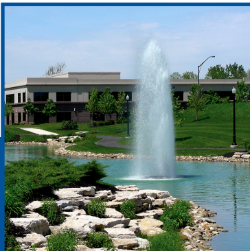
Polaris Floating Fountain

Our representatives are here to help you achieve the customised solution you desire. Contact us today for more information.