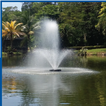
Phoenix Floating Fountain

Our representatives are here to help you achieve the customised solution you desire. Contact us today for more information.