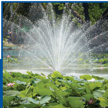
Equinox Floating Fountain