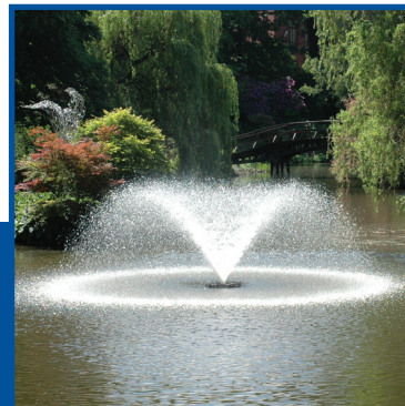
Sunburst Aerating Fountain

T +61 (8) 6260 1000 E SALES@AQUATECEQUIPMENT.COM