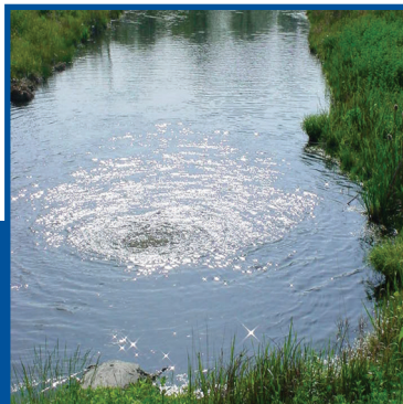
Sub Triton Mixer