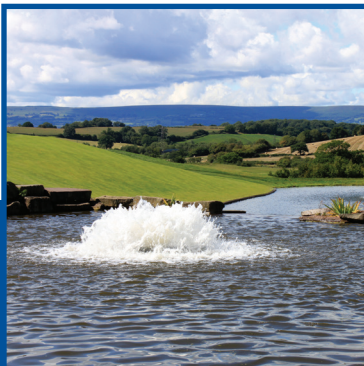
High Volume Aerator

Our representatives are here to help you get the customised solution you desire. Contact us today for more information.