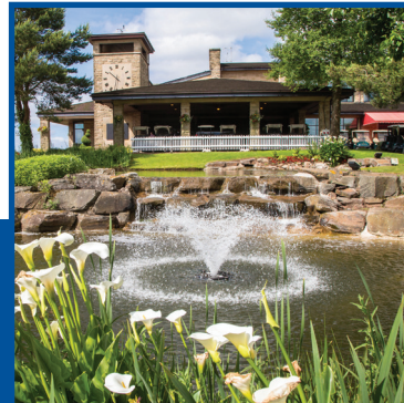
Gemini Floating Fountain

T +61 (8) 6260 1000 E SALES@AQUATECEQUIPMENT.COM