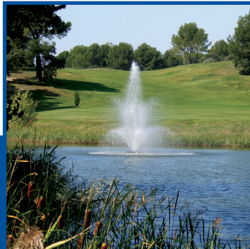
Tristar Floating Fountain